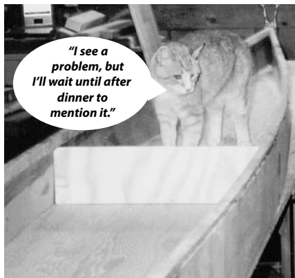
"Curry" is in charge of quality control.

form to the curvature of the deck. The deck is trimmed to overhang the sides by only 1 in. All the contacting surfaces are coated with epoxy thickened with Cab-O-Sil. The underside of the deck is coated with unthickened epoxy. The deck is aligned with the sides using the reference lines. Ring nails (bronze) are then driven into the sheer clamps at the marked intervals