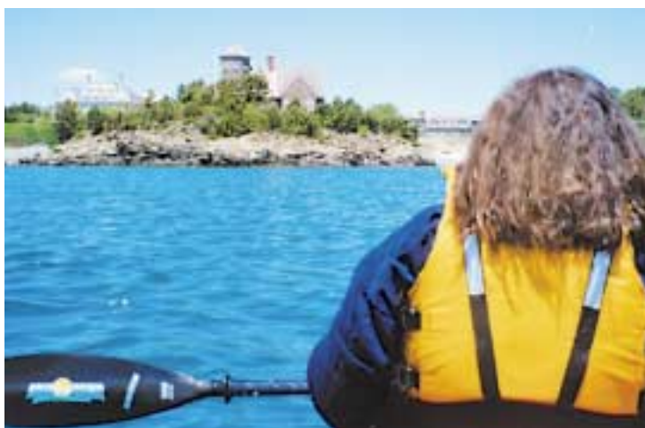
Newport mansions from the water.