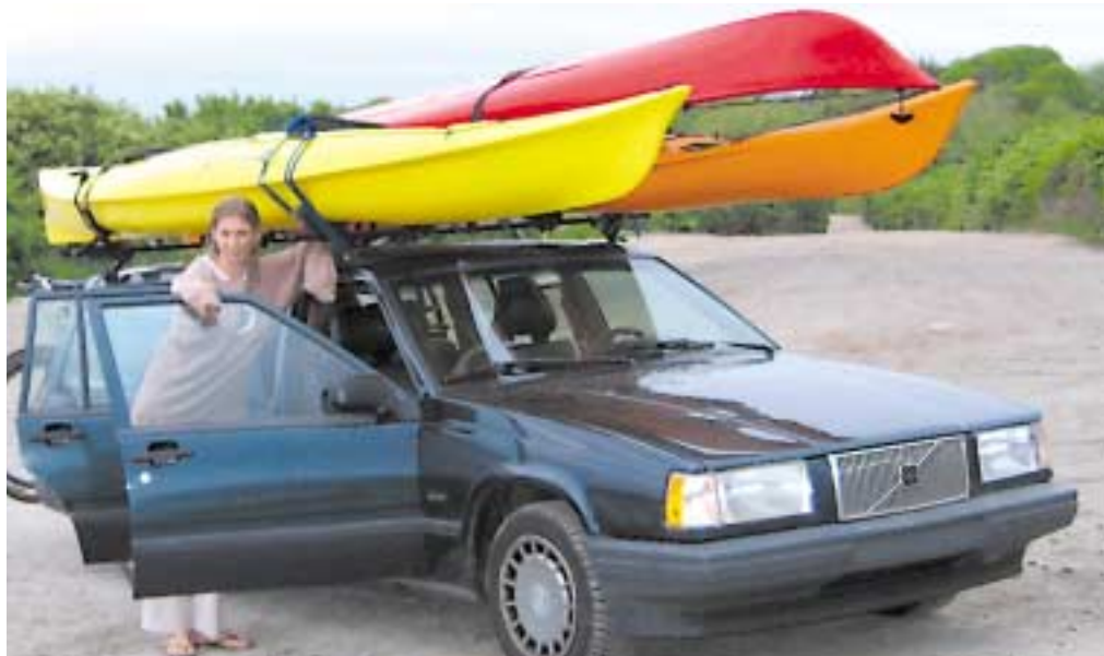
We arrive at the King's Beach put-in at 4:30 pm, Heritage Kayaks piled on the Volvo.