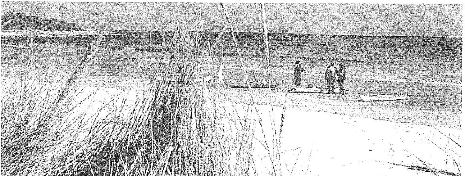
A calm winter's day on the southern side of Fisher's Island.